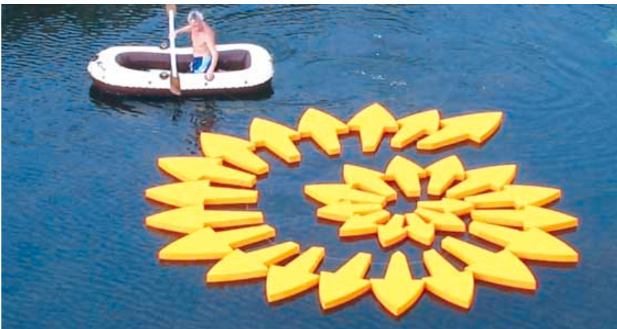
"The Spiral of Golden Arrows"