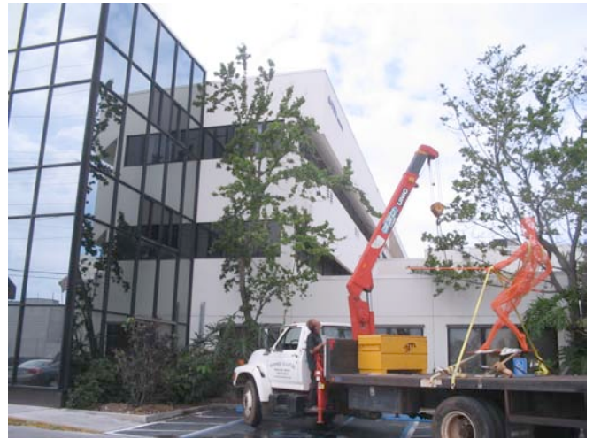
Jack Howard-Potter’s sculpture Pulling III being installed at the DePoo Medical building.