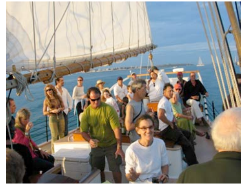
Artists and friends enjoy a sunset sail and a view of the exhibition by sea during the Schooner Liberty Artists' Sail.