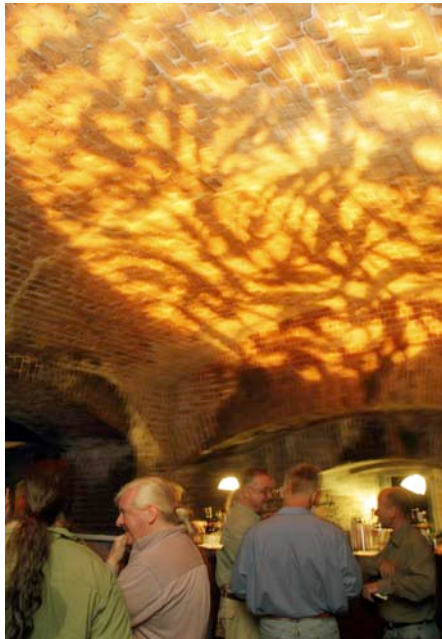
Dramatic lighting during Art Lights Fort Taylor.