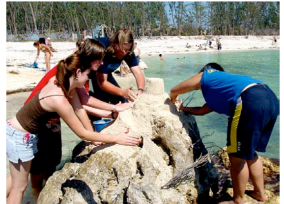
Photos from High School students’ field trip to the park.