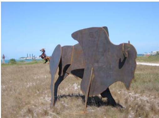
Yigal Meron & Eitan Dor "The Buffalo—an American Saga"

Sculpture Key West P.O. Box 7 Key West, FL 33041