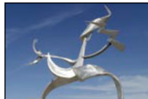
Click for Video

Fort Zachary Taylor, a Civil War-era fort on Key West's Atlantic Ocean shore, will become a unique sculpture gallery during Sculpture Key West, set for January 15-March 17, 2006 in the island city. The exhibit of large-scale contemporary sculpture will be displayed against the background of the fort and the Atlantic-front state park that surrounds it.